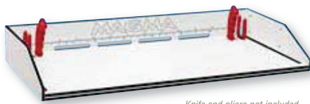
Knife and pliers not included

Includes 34" (86cm) table only, choose from our wide selection of mounting options (see page 5)