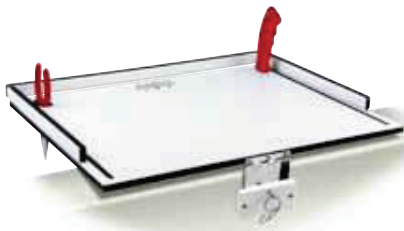
Knife and pliers not included