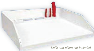
Knife and pliers not included

Includes: 20" (51cm) table and T10-355 "LevelLock" fully adjustable fish rod holder mount. Fits standard size fish rod holders.