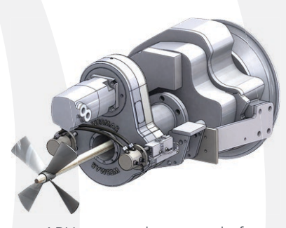
APU mounted to prop shaft