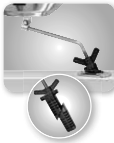
POW'R GRIP™ Fish Rod Holder Mount A10-175

Fits standard fish rod holders Use with any Magma Marine Kettle Grill