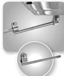
Mounting Extension A10-140

Use with any Magma Marine Kettle Grill See website for application details