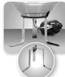
Folding Shore Stand/Table Top Legs A10-650

Adds 8" (20 cm) Use with any Magma Marine Kettle Grill