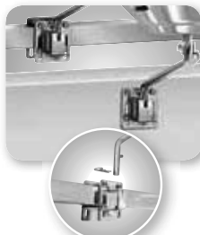
Side (Bulkhead) or Square/Flat Rail Mount A10-240

Fits Scotty®/Striker Grip Rod Holder Sockets Use with any Magma Marine Kettle Grill Rod holder sockets not included.