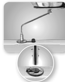
Locking Flush Deck Socket Mount A10-126