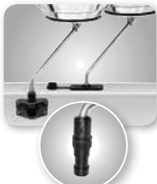
Socket Type Rod Holder Mount A10-165

Fits Tempress Fish-On® & Roberts Rod Holder Sockets Use with any Magma Marine Kettle Grill Rod holder sockets not included.