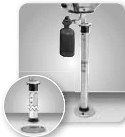
Double Locking "Stowable" Pedestal Mount A10-184