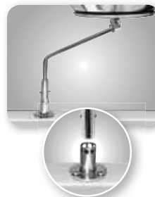
Locking Surface Deck Socket Mount A10-121

Fits standard fish rod holders Use with any Magma Marine Kettle Grill