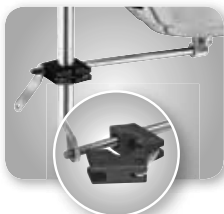
Round Rail Mount A10-080 Standard Rails 7/8" or 1" (22 mm or 25.5 mm) A10-085 Oversize Rails 1-1/8" or 1-1/4" (28.5 mm or 32 mm) A10-090 Large Rails 1-1/2" (38 mm)