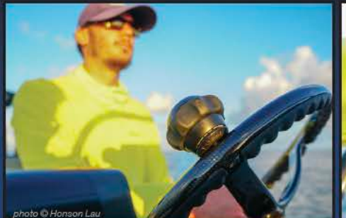
Edson's ComfortGrip™ PowerKnob™now Black!